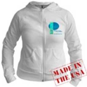
Jr. Hoodie $24.99