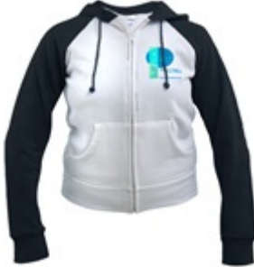
Women's Raglan Hoodie $26.99