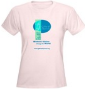
Women's Pink T-Shirt $14.99