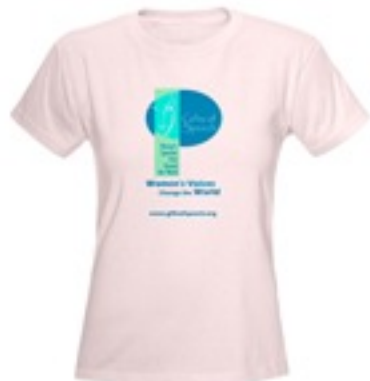
Women's Pink T-Shirt